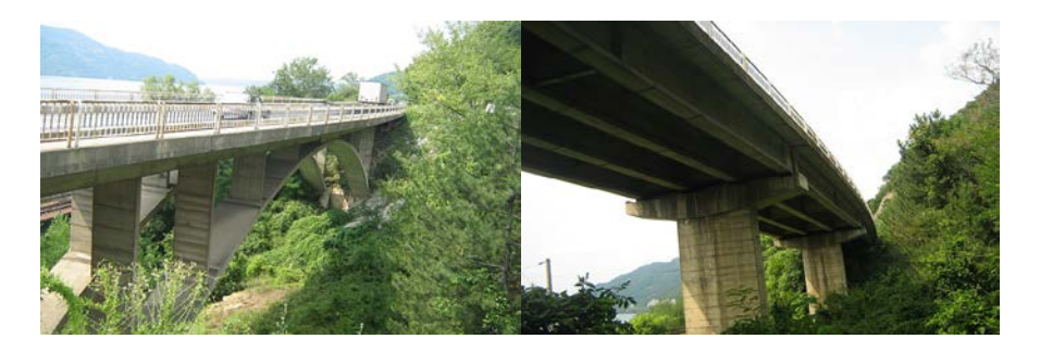
Figure. 1. Viaduct on DN 6 km 358+268; km 358+720

For actual convoys passing on road bridges, reinforced concrete and metal, the degree of fatigue can be established, with the Langer - Miner principle, methodology adopted by the European norms EUROCOD.