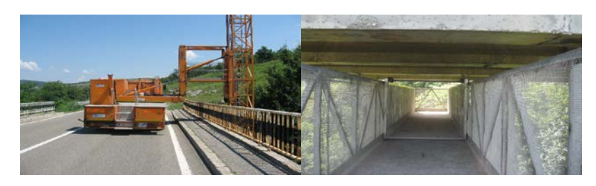
Fig. 2. (a) MOOG type bridge inspector (b) The working platform of the MOOG bridge inspector.

investigation and inspection of infrastructure and superstructure elements, but also for intervention and remedial works of degradation, the Regional Directorate of Roads and Bridges Timisoara has the MOOG type bridge inspector.