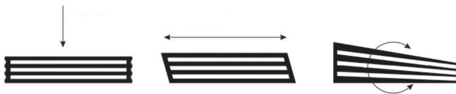
Figure 3. Deformation of the elastomeric bearings (NAL) due to vertical force, horizontal force and bending moment

Elastomeric bearings allow construction responds to dynamic load. Through them part of the construction can dynamically be switched off - isolated. This possibility is very important when a bridge construction should be isolated from the seismic influence, allowing to submit predicted earthquake in elastic state without damage.