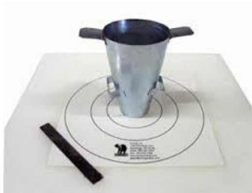
Figure 1: Slump – flow test

Slump-flow classes [5]: SF1 550 to 650 mm; SF2 660 to 750 mm; SF3 760 to 850 mm