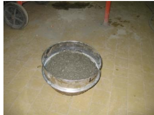
Figure 4: Sieve segregation test

Segregated portion (%) [5]: SR1 \leq 20; SR2 \leq 15