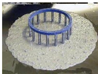
Figure 5: J ring test

J-ring step (mm) [5]: PJ1 \leq 10 with 12 rebars; PJ2 \leq 10 with 16 rebars