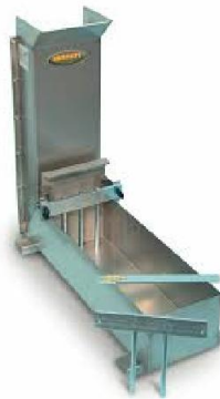
Figure 3: L-box test

This test, based on a Japanese design for underwater concrete, has been described by Petersson. The apparatus consists of a rectangular-section box in the shape of an 'L', with a vertical and horizontal section, separated by a moveable gate, in front of which vertical lengths of reinforcement bar are fitted (Fig.3). The vertical section is filled with concrete, then the gate lifted to let the concrete flow into the horizontal section. When the flow has stopped, the height of the concrete at the end of the horizontal section is expressed as a proportion of that remaining in the vertical section. This is an indication of passing ability, or the degree to which the passage of concrete through the bars is restricted.