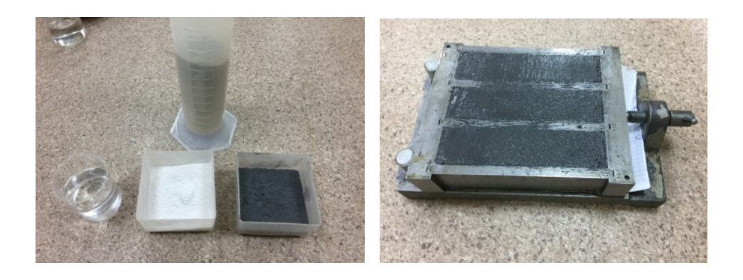
Figure 18. Component materials for testing of pozzolanic activity

The pozzolanic activity has been studied on specimens prepared according to the procedure given in SRPS B.C1.017-2001 [8]. The class of pozzolanic material was determined based on 7 day compressive ( f_p ) and flexural ( f_{zs} ) strength of standard mortar prisms [9]. Mortars were prepared with biomass ash, slaked lime and standard sand, (Figure 18), with following mass proportions: m_{sl}:m_{bash}:m_{qs}=1:2:9 and water/binder ratio 0,6 (where: m_{sl} – mass of slaked lime; m_{bash} – mass of biomass ash; m_{ss} – mas of CEN standard sand). After compacting (Figure 19), specimens were hermetically packed and cured 24h on 20<sup>o</sup>C, then 5 days on 55<sup>o</sup>C. After cooling of specimens in next 24h up to 20<sup>o</sup>C, compressive and flexural strength were tested.