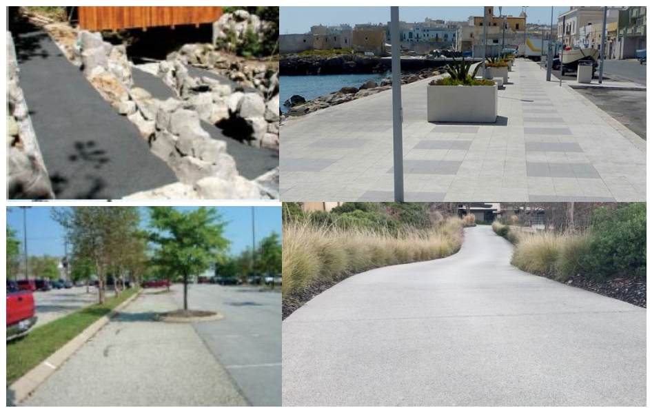
Figure 1. Examples of porous concrete application [4]

Porous concrete is not difficult to install, but it differs from standard concrete and appropriate installation techniques are required in order to achieve its effectiveness. It has a relatively rigid consistency that requires special placement and installation conditions. It is important to use a vibrating plate to achieve optimal density and strength. After that, the material is compacted with rollers and it is not necessary to use tools for leveling the surface. Expansion joints can be formed shortly after consolidation or notched using conventional cutting equipment. However, cutting can cause the concrete to crack at the joint. Porous concrete pavements can be without expansion joints [4].