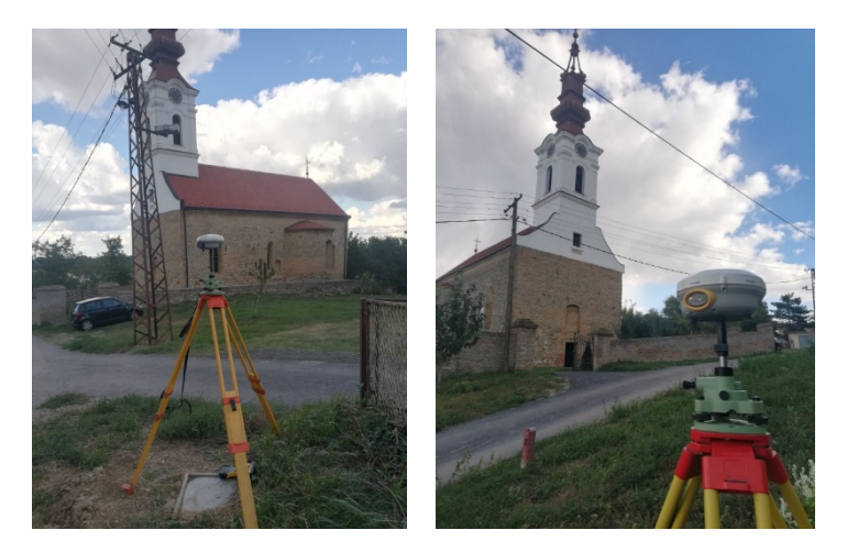
Figure 3. Force-centered GNSS antenna