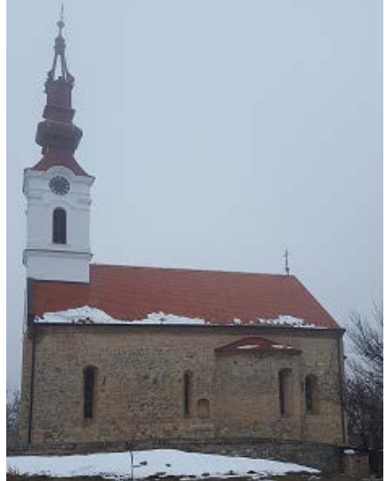
Figure 1. Church of St. Nicholas in Stari Slankamen

Савремена достигнућа у грађевинарству 23-24. април 2019. Суботица, СРБИЈА