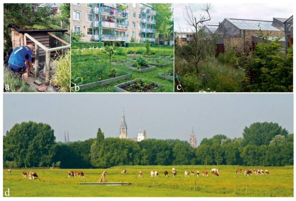
Figure 1. Different categories of urban agriculture

a) Non-profit, child-friendly micro-farming (EVA-Lanxmeer, Culemborg); b) Non-profit community garden in inner courtyard (Wippolder, Delft); c) Small-scale semi-commercial greenhouses (EVA-Lanxmeer, Culemborg); d) Commercial urban farm on the edge of the city ('Hoeve Biesland' near Delft)