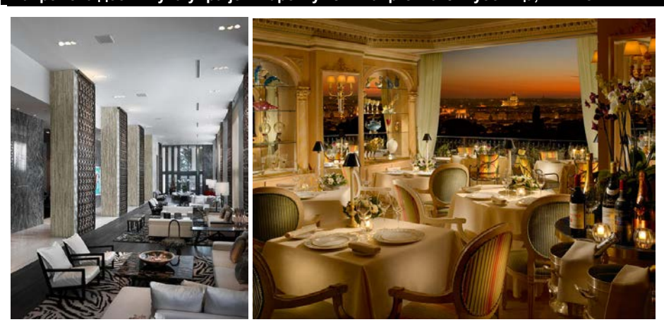
Figures 6 and 7 Colors and illumination in hotels and luxurious restaurants

Artificial illumination (relative to natural) is an architectural tool that is easier to apply and requires less skill and effort to obtain the desired result (Figure 23 and 24).