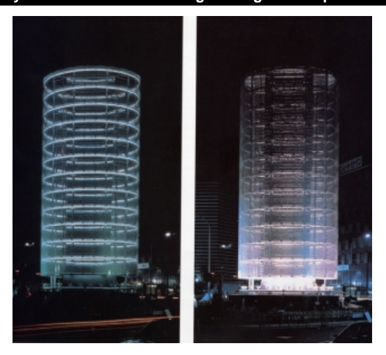
Figure 9 The use of artificial illumination, Yokahoma Tower of wind