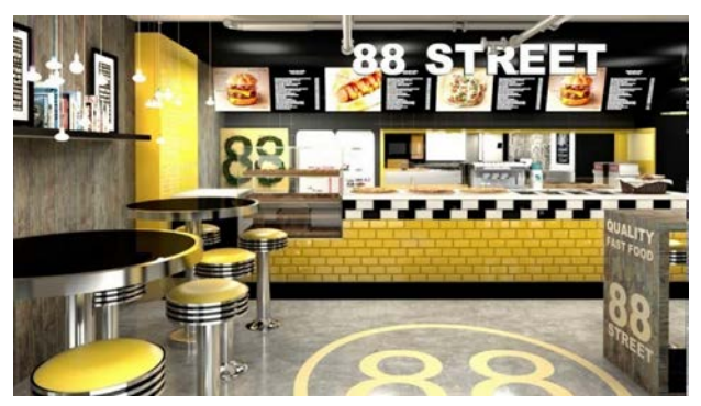
Figures 4 and 5 Colors and illumination in fast food restaurants

On the other hand, hotel lobbies are designed with a view to having the user wish to remain longer as well as having him go back to the place where he or she acquired a good sense of intimacy, relaxedness and comfort. The same design strategy is applied by luxurious restaurants aimed at having the guest feel comfortable to make sure that he or she spends as much time in the space and take the feeling of comfort in order to wish to go back to the same place.