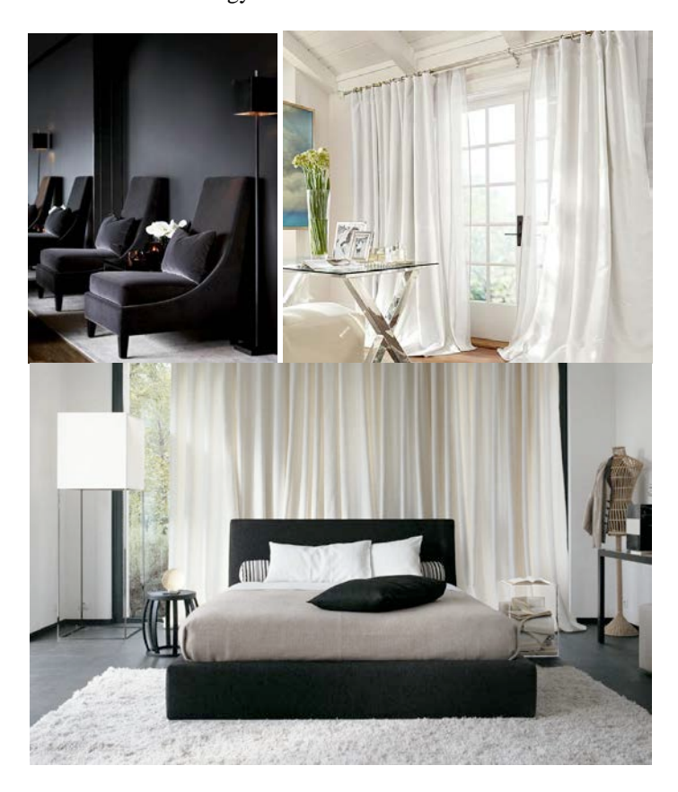
Figures 1, 2, 3 Examples of illuminance and reflectance of materials relative to the color and light

The discrepancy between physical and perceptive facts is revealed when we try to answer the question: How bright are things? We cannot explain the facts talking about the "permanence" of brightness, certainly not in the sense of asserting that objects are seen "as bright as they really are". The brightness we see depends, in a complex way, on the light distribution in the overall situation. It depends on the processes in the eyes of the beholder, as well as the physical ability of the object to absorb and maintain the light it receives. That physical capability is called luminance or reflectance.8 Depending on the light strength, one object can reflect more or less light, but its luminance, i.e. percentage of light it reflects, remains the same. A piece of black velvet absorbing a lot of light it receives can, under strong light, reflect back the same amount of light as a poorly lit piece of silk that reflects the most of energy.