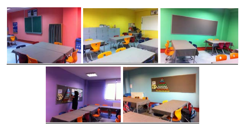
Figure 5. Classrooms in 5 various colors, used in the experiment [13]

the classroom wall color and attention levels of students. This kind of research can considerably improve the quality of life of the people in the various aspects of everyday life.