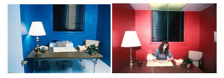
Figure 4. Blue and red office [10]

The first in the series of experiments is focused on the performance of typing texts depending on the color of the office in which it is done – red or blue, figure 4,[10]. Eighteen women and eighteen men, older than 18 years are divided into four groups. The first group remains in the red office during the entire experiment, the second remains in the blue office during the entire experiment, the third starts in the red room and ends in the blue room, while the last starts in the blue room and ends in the red room. All the walls in both offices are fully colored in the appropriate color, it is, red or blue. The task comprised a text to retype, as well as a questionnaire to be filled in after typing by each participant. The highest number of typing errors was made by the group changing the offices, i.e. the one going from the blue into the red office. From the questionnaire, it could be concluded that he red office was related to anxiety, and blue to depression. The participants who changed offices, were increasingly excited.