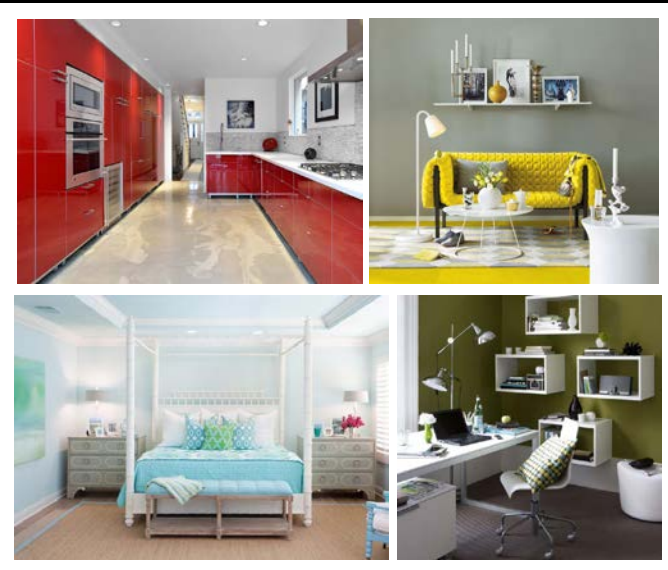
Figure 3 a. Usage of red color in the kitchen and yellow in the living room.[6,7] Figure 3 b. Usage of blue and green colors in the bedroom and study interiors [8,9]

Савремена достигнућа у грађевинарству 23-24. април 2019. Суботица, СРБИЈА