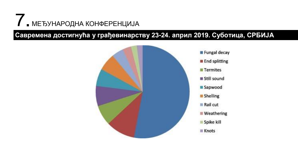
Fig.1. Causes of timber sleeper failures [3]

There is a problem appearing with a last class of damaged sleepers need to be strenght with fibre composite wraps or replaced.