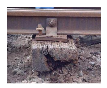
Fig.2. Appearance of fungal decay

There is a problem appearing with a last class of damaged sleepers need to be strenght with fibre composite wraps or replaced.