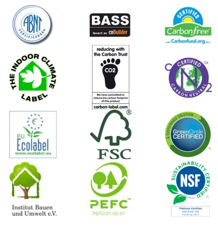
Figure 3 – Some of the eccollabels associations

In the open market there are an increasing number of Ecolabel associations (figure 3), many of them having the same role in the declaration of the ECO friendly of a material. Thus it appears the need of standardize and group of the associations in order to have a clear legislation in the authorization process – in the future normatives there is the need of imposing new / environmentally friendly materials.