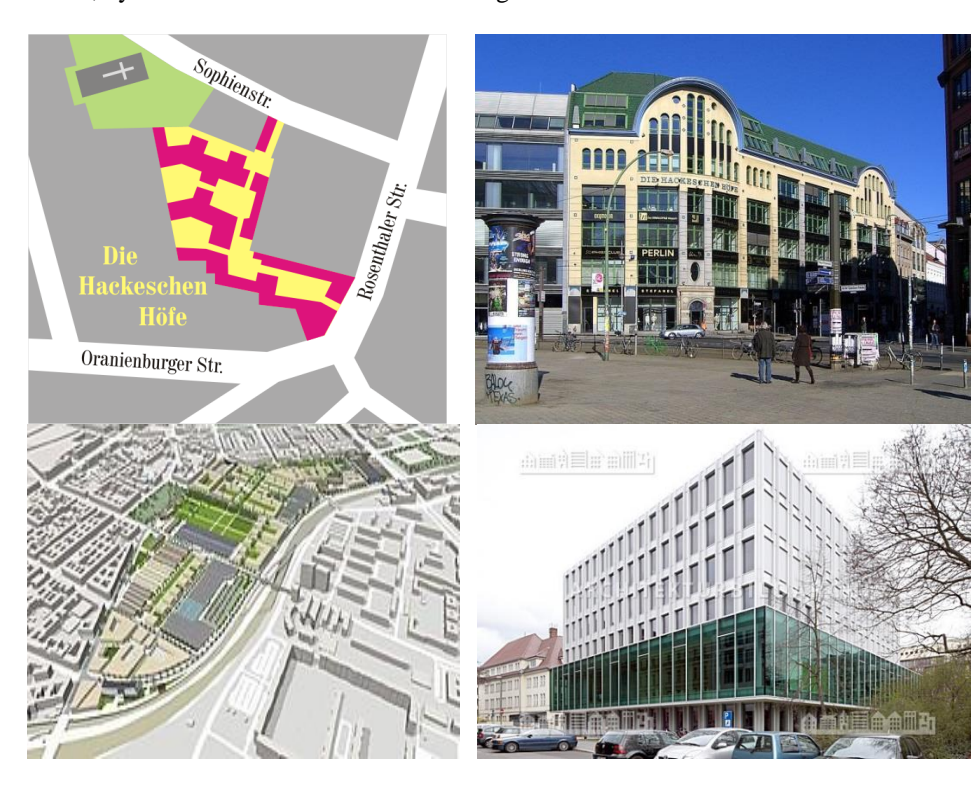
Figure 2a and b. The layout of the interconecred courtyards of Hackesche Höfe in Berlin and street facades with new wing (photo Manfred Bruckels -www.berlinstadtservice.de/) Fig. 3 a and b. Model of the redeloping plan of the stockyard and Green memory archive building of Heinrich Boell Foundation /with old buildings on left/ in Berlin (http://www.gtb-berlin.de/en/projects/listed-buildings/heinrich-boell/) (https://en.kusch.com/references/auditorium/heinrich-boell-stiftung-e-v-berlin-germany)

Similar examples of large urban areas with buildings whose purposes are no longer suitable for urban centers could be find in all countries. Within such protected areas, the buildings have a different architectural value. Therefore, it is necessary to do a whole series of research, analysis and offer a series of scenarios, so that interventions and extensions on buildings and rearengement of urban spaces will be harmonized and added, by not erased the value of the existing one.