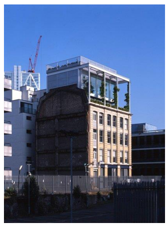
Figure 5. a and b. Clere Street Penthouse by Tonkin Liu, over warehouse building in London, 2008, fron and rear facades (<a href="http://www.contemporist.com/clere-street-penthouse-by-tonkin-liu/">http://www.contemporist.com/clere-street-penthouse-by-tonkin-liu/</a>)