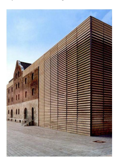
Figure 1. a Museum de Fundatio with egg-shaped extention as an excess in space by B. Henket architect, Zwolle 2013.

(https://www.google.com/search?q=museum+de+fundatie+zwolle+the+netherlands&oq) b Cultural Memory (Kulturspeicher) with neutral extention by Brueckner and Brueckner, Würcburg 2002. (https://www.baunetz-architekten.de/brueckner-und-brueckner/31411/projekt/171349)