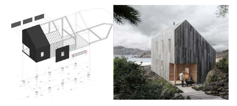
Figure 8. Laying the layers of the object Figure 9. The final look of the object