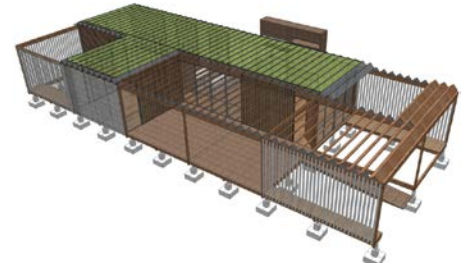
Figure 2. The wood construction of the house

The second case study is the project of Abarca and Palma studio. The house is constructed in pine wood—using composite beams and pillars—with prefabricated SIP panels and developed as a modular house proposal made up of 10 different types of module, capable of forming 5 different house layouts. This is a system of prefabricated modular units of space within a modular structure constructed on site. The wooden structure is built in situ by carpenters prior to the arrival of the prefabricated panels that are mounted inside. The structure is designed to be built in pine wood using composite