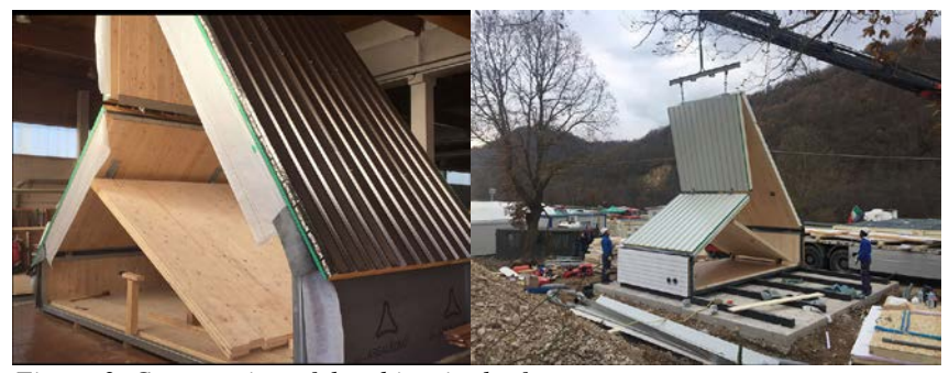
Figure 3. Construction of the object in the factory Figure. Construction of the object in the site