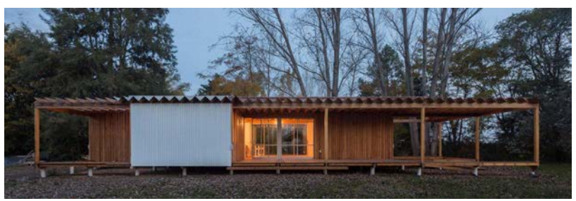
Figure 1. Casa de Madera prefabricated wood house

Thanks to modern prefabrication technologies, the design boundaries have been shifted and it has succeeded in reaching very attractive modern forms in which environmental aspects are taken into account. The only constraints that can occur in prefabrication are in the transport of elements to the site. The first case study is a house built in Exaltación de la Cruz, Argentina, Estudio Borrachia Architects and area-174.0 m2. Which is designed as a modular system in accordance with the technological possibilities allowed by wooden construction. This house was built within five months without the change of ecosystem, which enables the preservation of the natural state. Even if necessary, it can be removed in a few days, and the environment is left behind. With this object, the wood used for construction, coating, division and deck, playing a leading role in the material logic of this house, and at the same time a search engine for new constructive alternatives, based on systems and materials that are simpler to manufacture and handle, exist throughout the territory our countries and adapted to different geographical and climatic conditions. This house offers not only a response to the timely and specific problem of your design and construction, but also to the study of the verification of a series of investigations that have been carried out for several years on the implementation of a prefabricated system of low-cost, quicker implementation [5].