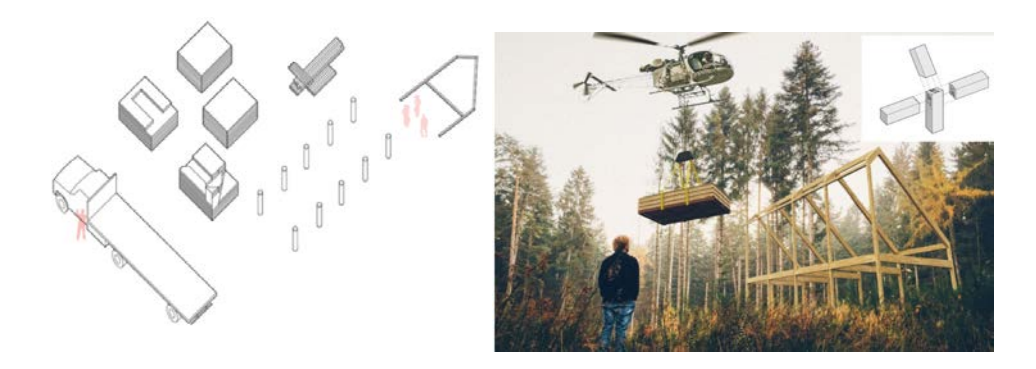
Figure 6. Flat-packed on pallets for shipping Figure 7. The site preparation

The third case study is The Backcountry Hut House as an example of an excellent prefabricated building, seen through the construction, design, and sustainability of the building. The design is reflected in the fact that the components are made into the factory and then each component is flat-packed on pallets for shipping to a location close to the site, then transported via air or off-road vehicles. The site preparation does not require heavy machinery for minimal site disruption. Piling holes are hand-dug and concrete is poured into sonotubes to form piles for the foundation. A prefabricated core minimizes the carbon footprint and site imprint of the structural assembly. Prefabrication allows for an economy and conservation of material and energy usage in the production and assembly of the building components. The hut can serve different purposes: the client can set it up as a backcountry hut for outdoor groups or can use it as a front-country hut for personal usage. The basic shell consists of 4 posts, 4 beams and a roof. The hut fits a community kitchen at the bottom and a bunk-bed sleeping area at the top floor. Environmentally sensitive products are used for all materials such as: engineered wood products, FSC certified lumber, 100% recyclable components [7].