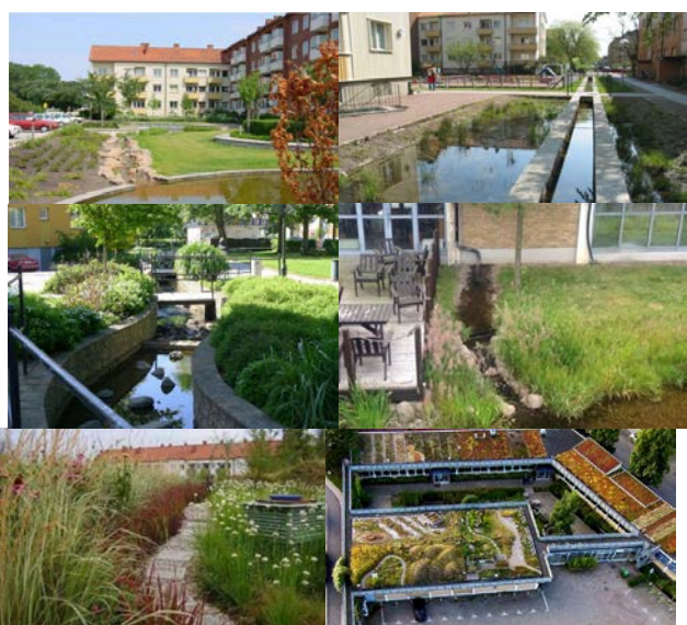
Figure 4. Technical elements of SuDS integrated in the process of urban regeneration in residential ares of Augustenborg, Malmo [9]

Thus, WSUD recognizes the following elements: 1) swales (dry or wet); 2) filter trenches; 3) sand filters; 4) bioretension systems; 5) porous paving; 6) infiltration channels; 7) infiltration basins; 8) rainwater tanks; and 9) elements of landscape architecture. In the framework of SuDS, the division of elements is as follows: 1) porous paving (pedestrian communication and other surfaces); 2) filter belts; 3) filter and infiltration trenches; 4) swales (dry or wet); 5) retention ponds; 6) underground rainwater storage tanks; 7) swamps; and 8) little water surface - lakes (Figure 4).