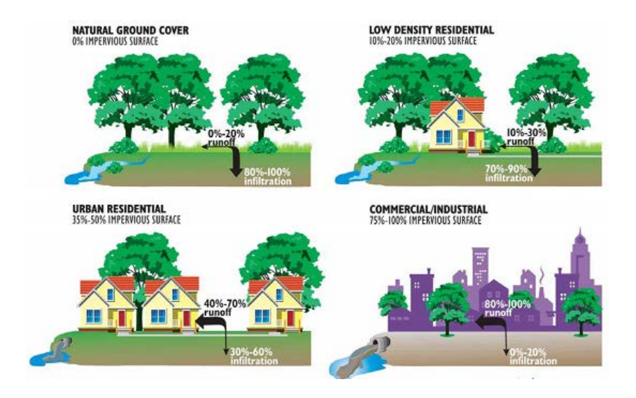
Figure 1. Influence of the intensity of urbanization on the increase of surface rainfall [4]

possibility of infiltration or it is reduced to a minimum. Numerous studies indicate a direct connection between the intensity of the urbanization process (expressed by increasing population density and greater participation of impermeable surfaces) with an increase in the amount of rainfall that is retained on the surface (Figure 1).