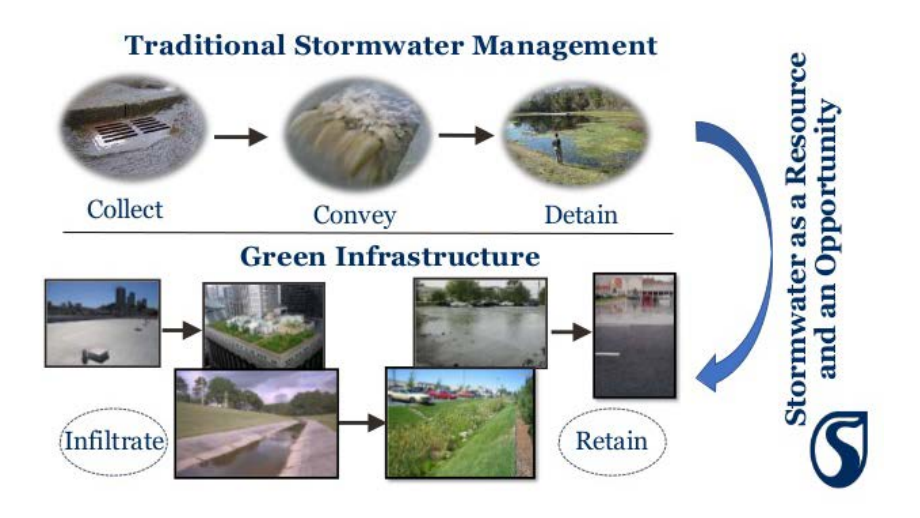
1 Figure 2. Evolution in stormwater management [7]

For example, Sustainable Drainage System (SuDS) is an stormwater management approach that takes into account the amount of water (flooding), water quality (pollution) and questions of affection, while in technical terms it presents a set of management practices, control facilities and strategies designed to efficiently and effectively drain surface water, while reducing pollution to the smallest possible extent and managing the impact of quality on local water bodies. On the other hand, WSUD is an approach based on the integration of stormwater management into the process of urban planning and design in order to reduce environmental degradation and improve its sustainability and attractiveness [6]. However, regardless of specificity and certain differences, all approaches are commonly based on the same conceptual definition (Figure 2) - replacement of the existing drainage system in urban basins or creating new drainage systems using measures and elements that imitate or support the natural environment [1].