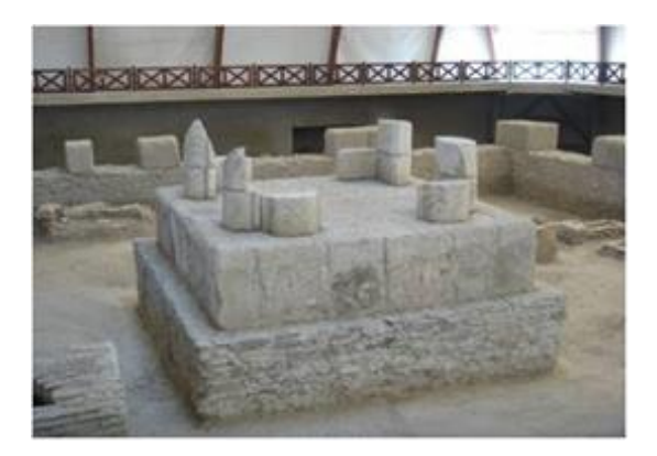
Pic 4 – The protection and presentation of the mausoleum

The third very important building excavated on the site is the mausoleum . The mausoleum is square in plan and it measures 20x20 meters. It is built of stone blocks and ashlars and decorated with columns. In the middle part of the mausoleum there is a central building of dimension 5x5 m built of green schist bonded by mortar. There are stone pedestals which carried columns at the corners of the building. In the central part of this building there is a tomb. The mausoleum probably ended in a triangle. [6]