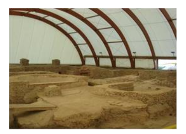
Pic 3 – The protection and presentation of the baths

The baths can be specifically distinguished in Viminacium not only by its splendor but also by its architectural design. The archaeological excavations have shown that there were five conchs, four of which were the so-called tepidaria and the fifth one was a frigidarium. The baths have been preserved to the level of the hypocaust, which shows evidence of several stages of construction. The remains of fresco paintings testify to the luxury of the baths. [5]