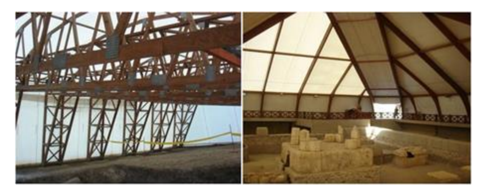
Pic 6 – The protective structures over the northern gate of the military camp (left) and over the mausoleum (right)

The roofing structure follows the form of the space it covers. The biggest, central grave in the necropolis is lit directly through the top part of the structure. Thus the central part in the necropolis is highlightened. [11]