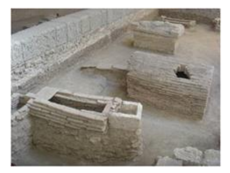
Pic 5 – The protection and presentation of certain tombstones within the Mausoleum

Over 10.000 graves dating from 4<sup>th</sup> century BC to 6<sup>th</sup> century AD have been uncovered during excavation carried so far. There are several variants of these grave forms: common rectangular grave pits, sometimes with a cover made of fire-baked bricks laid flat or in two sloped roof, with a plank or longitudinal half of an amphora as a cover, and graves a étage which could have inner floor built in.