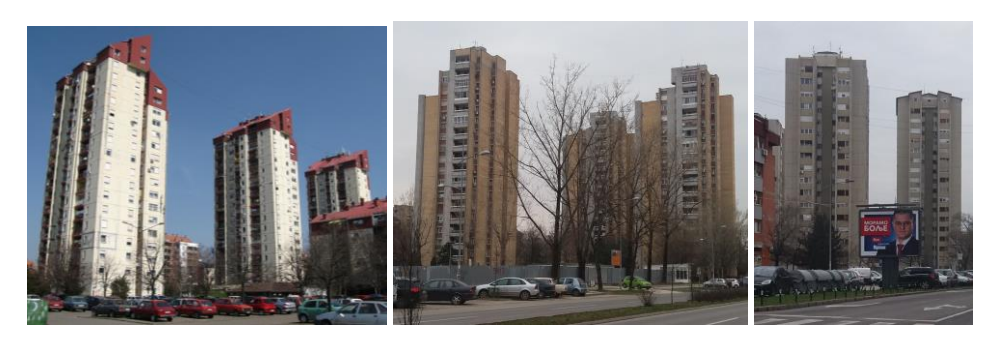
Figure 3. The residental towers at Liman district (Liman 4, 3, 2)