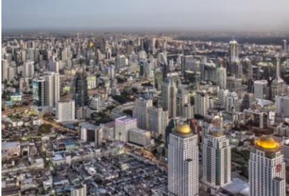
Figure 2. The appearance of the settlements with a large number of high rise buildings (Vancouver, Bangkok)

High buildings in the cities worldwide have diverse uses, and they are often polyfunctional. Utilization of the space in case of their existence has multiplied, but the other aspect is the question of the quality of urban values, psychological and social security, and a connection with the ground, economy, maintenance, and identity. The sustainability of such facilities is completely different when it comes to buildings of a multi-storey residential and business type. A tendency to build these structures changes the face of settlements worldwide, makes them similar and exclusive, whereas the spirit of the place and quality of space are lost and the city as a scenery becomes similar to some other and loses its characteristics and identity.