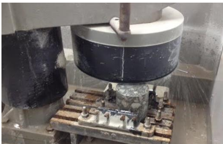
Figure 2. Preparation of the ends of the samples by grinding

The way of preparing ends of the samples by grinding is shown in Figure 2.