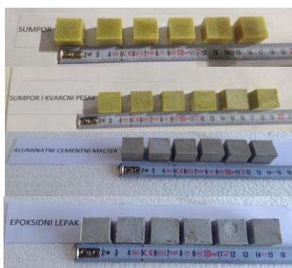
Figure 1. Samples for testing compressive strength of the material for surface leveling

Samples for testing compressive strength of the material for surface leveling is shown in Figure 1.