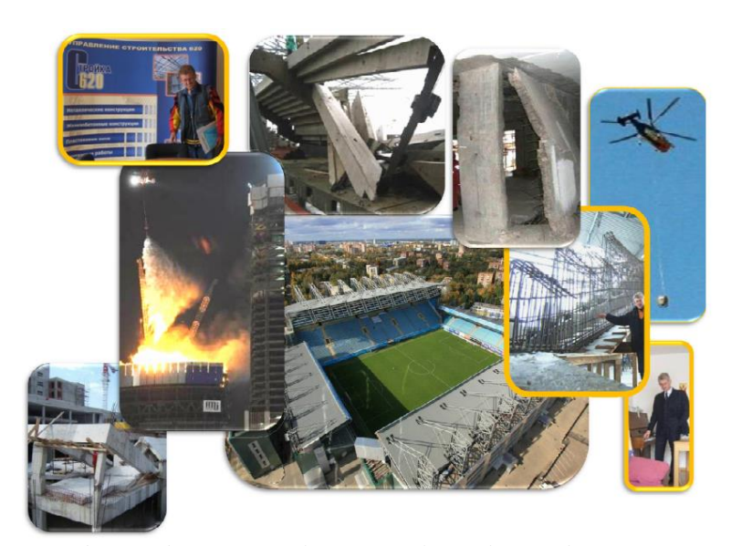
Figure 5. Accidents and ways to regulate some relationships in the construction practice

2-5. Business and accidents – Hic Rhodus, hic saltus. High class touristic, recreational, commercial and sports facilities from our near and far environment, useful area of up to 100.000, 00m<sup>2</sup> and values of projects up to 500,000,000.00 USD They all point to some not so rare particularities and even those on the other side of the law, which business brought and introduced into modern building. Especially in societies in transition or with a autocratic regime. Due to the limited space only basic information about the projects is presented along with the authors' original photos, and in the third part of the paper (Part 3/3) a more detailed descriptions with comments are provided.