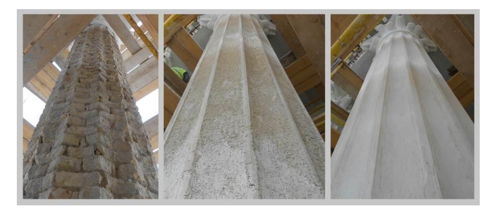
Figure 5. Work fazes – brick, rough layer, smooth layer

The materials were predefined by project documentation.