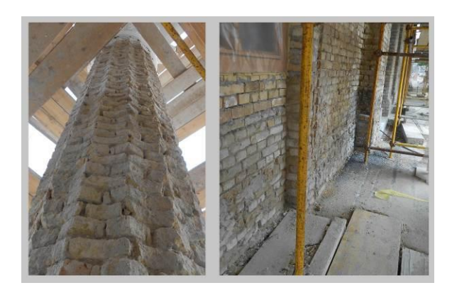
Figure 1. On site situation og the facade and columns