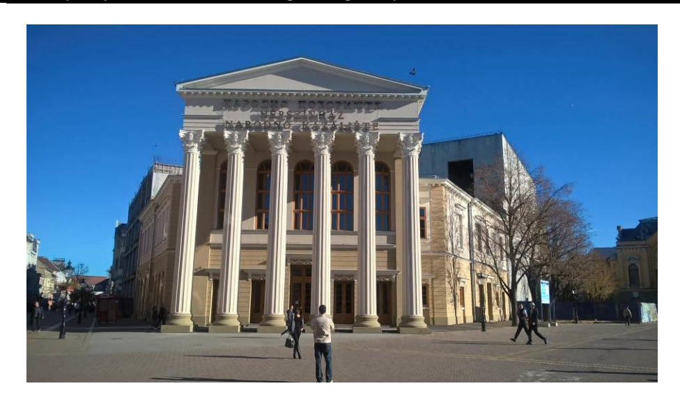
Figure 6. Building after the renovation

The base of the columns was solved with the same materials, using the tools specifically profiled for this purpose and with the skills of the masons engaged in this activities.